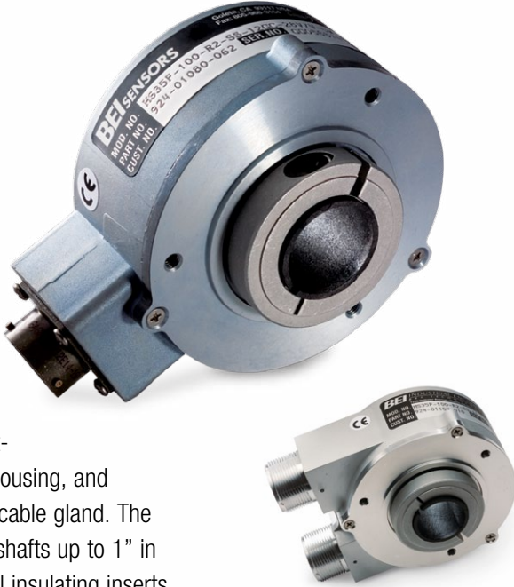
The HS35 Dual Output Encoder

The HS35 combines the rugged, heavy-duty features usually associated with shafted encoders into a hollow shaft style. Its design includes dual bearings and shaft seals for NEMA 4, 13 and IP65 environmental ratings, a rugged metal housing, and a sealed connector or cable gland. The HS35 accommodates shafts up to 1" in diameter. With optional insulating inserts, it can be mounted on smaller diameter shafts. It can be mounted on a through shaft or a blind shaft with a closed cover to maintain its environmental rating. The HS35 is also available with a dual output option (inset) to provide redundant encoder signals, dual resolutions, or to supply two separate controllers from a single encoder. Applications include motor feedback and vector control, printing industries, robotic control, oil service industries, and web process control.