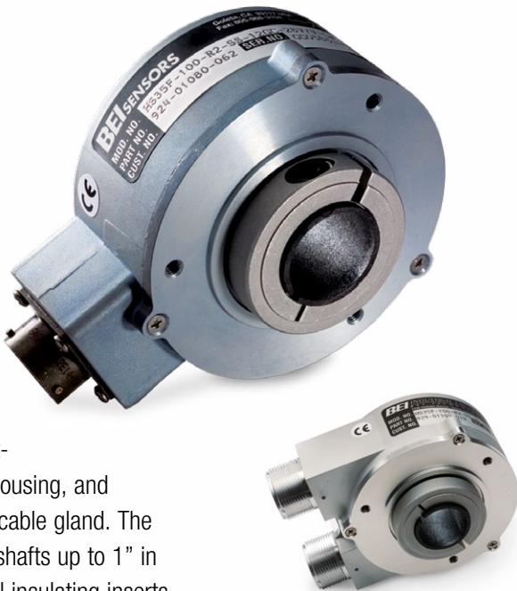
The HS35 Dual Output Encoder

The HS35 combines the rugged, heavy-duty features usually associated with shafted encoders into a hollow shaft style. Its design includes dual bearings and shaft seals for NEMA 4, 13 and IP65 environmental ratings, a rugged metal housing, and a sealed connector or cable gland. The HS35 accommodates shafts up to 1" in diameter. With optional insulating inserts, it can be mounted on smaller diameter shafts. It can be mounted on a through shaft or a blind shaft with a closed cover to maintain its environmental rating. The HS35 is also available with a dual output option (inset) to provide redundant encoder signals, dual resolutions, or to supply two separate controllers from a single encoder. Applications include motor feedback and vector control, printing industries, robotic control, oil service industries, and web process control.