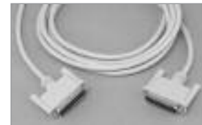
DB25 Data Switch Cable 25 Conductor, 28 AWG, Shielded