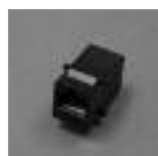
Unshielded Cat 4 RJ-45 Keystone Feed Through Adapter Black