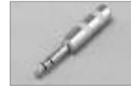
1/4" Stereo Plug (M) Metal