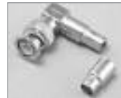
Right Angle, Crimp BNC (M) 2 Piece, Solderless