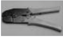
D-Sub Full Cycle Ratchet Crimping Tool Crimps 10-22 AWG Non-Insulated Open Barrel Connectors, D-Sub & V.35 Contacts.

Blister No. 24-8644P Replacement Die No. 99-8644