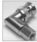
Right Angle, Twist-On BNC (M) 1 Piece, Crimpless & Solderless