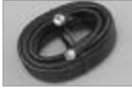
F-59 Hook-Up Cable with Gold Connectors Molded Strain Relief, 75 Ohm, Packaged for Retail Display.