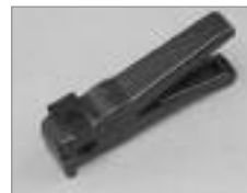
2-Step Cable Stripper with adjustable replacement blades for RG-6, 58, 59 & 62. Poly bagged.