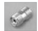
UHF (F) to 'F' (M)