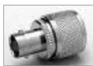
UG-273/U Adapter UHF (M) to BNC (F)