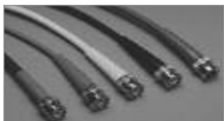
RG-59 Audio & Video BNC to BNC Cables Constructed of RG-59, 75 Ohm, 80% Braid, 22 AWG Stranded Cable, Matching Colored Boots & Cable.

As part of the Emerson Network Power Connectivity Solutions, we offer a wide selection of quality cables and jumpers in most connector styles and lengths. With production capabilities in USA, Mexico and Asia, we offer our customers the flexibility of quick turn assembled and molded cables in all styles and configurations, including Cat5E/6 jumpers, telco cables, Coaxial LAN, D-Sub, Audio/Video cables and many more.