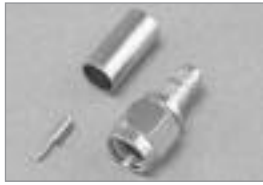
SMA for Flexible Cable (M) Crimp, 3 Piece, Solder or Crimp Center Pin