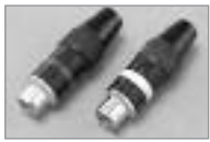
RCA Jack (F) Gold Plated