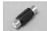
Inline Adapter, Plastic RCA (F) to RCA (F) Gold Plated