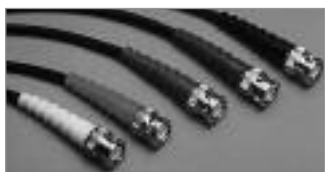
RG-58 Thin Ethernet BNC to BNC Cables Constructed of 50 Ohm, 95% Braid & 100% Foil Shield Cable, 20 AWG Stranded (Belden 9907 Equivalent), Black PVC Cable.