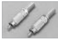
RCA Plug (M) Gold Plated