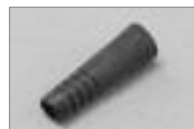
BNC Boots Black Only, 100 per bag