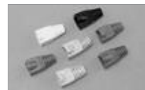
Colored Snagless Boots for RJ-45 8 Conductor Shielded and Unshielded Modular Plugs.