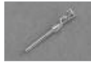
High Density D-Sub Pins for 98 & 99 Series (M) Gold Plated