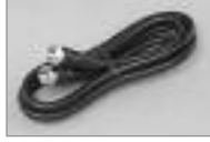
F-59 Hook-Up Cable with Molded Strain Relief 75 Ohm, Bulk Packaged.