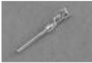
Standard D-Sub Pins for 98 & 99 Series (M) Gold Plated