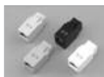
Unshielded Cat 5e RJ-45 Keystone Feed Through Adapter