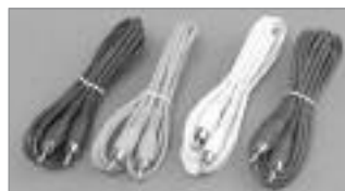
RG-59 Audio & Video RCA to RCA Cables Constructed of RG-59, 75 Ohm, 80% Braid, 22 AWG Stranded Cable, Matching Colored Boots & Cable.