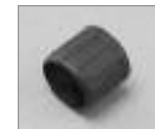
BNC Hood for 3-Piece Crimp Plug Black Only, 100 per bag