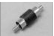
Inline Adapter RCA (M) to RCA (M) Gold Plated