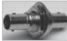
Dual BNC (F) 1/2" Chassis Mount Hole, UG-492