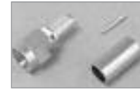
SMA (M) Crimp, 3 Piece, Solder or Crimp Center Pin