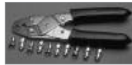
Standard Crimping Tool for RG-6 & RG-59. Includes (10) No. 25-7050 'F-59A' Connectors with attached 1/8" Ring.