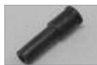
RG-59 Weatherproof Boot Black Only, 100 per bag