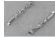
High Density D-Sub Pins for 98 & 99 Series (F) Gold Plated