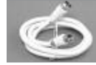
RG-59 Hook-up Cables with Molded Strain Relief 75 Ohm, Packaged for Retail Display.