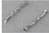
Standard D-Sub Pins for 98 & 99 Series (F) Gold Plated