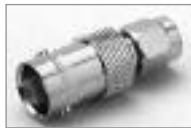
SMA (M) to BNC (F)