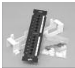
Vertical Wall Mount w/Bracket RJ-45/110 IDC, EIA 568A/B