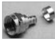
Crimp-On Gold Plated F-59 (M) with Separate 1/8" Ring.