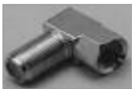
'F' (F) Right Angle to 'F' (M)