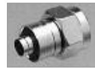
Crimp-On F-59A (M) with Attached 1/8" Ring.