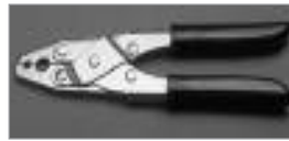
Standard Crimping Tool for RG-6 & RG-59. Economy packaged in non-retail box.