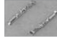
High Density D-Sub Pins for 98 & 99 Series (F) Gold Plated