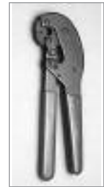
'F' Deluxe Hex Crimp Tool for RG-6 & 59.