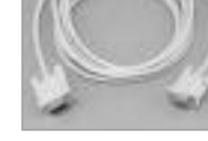
DB9 Data Extension Cable Wired Pin to Pin