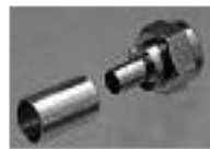
Crimp-On F-59 (M) with Separate 1/2" Ring.