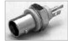
Isolated BNC (F) 3/8" Chassis Mount Hole