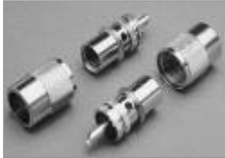
UHF (M) Solder, 2 Piece, PL-259