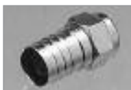
Crimp-On F-56ALM (M) for RG-6 Cable.