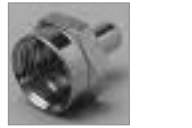
F-59T (M) Terminator 1/2 Watt @ 5%