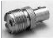
UHF (F) to BNC (F)