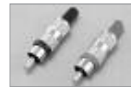
RCA Plug (M) Metal