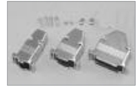
Shielded Metal 'HM' Series D-Sub Hoods includes Hardware, Silver.