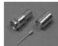
Crimp-On F-11 (M) 3 Piece, for Teflon/Plenum RG-11 Cable.

Part No. Cable Type Tool No. 25-7191 (CPF11ALM) RG-11 24-7711P