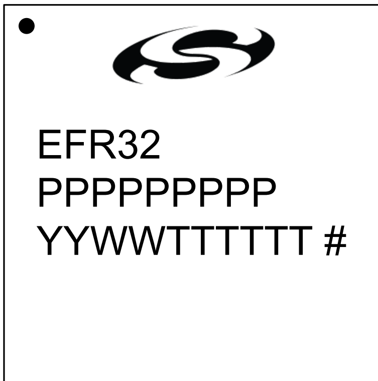
Figure 7.3. QFN48 Package Marking