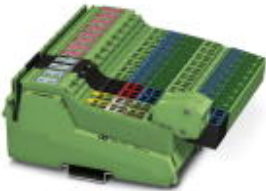
The illustration shows the version ILB IB 24 DO32

Inline, Block IO, INTERBUS remote bus, Inline shield connector, Digital outputs: 16, 24 V DC, 500 mA, 3-conductor, Degree of protection IP20, including Inline connector