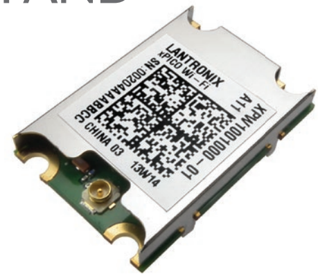
xPico Wi-Fi Actual Size

As one of the smallest embedded device servers in the world, xPico Wi-Fi can be utilized in designs typically intended for chip solutions, befitting in advantages to cost and time-to-market. Its “zero host load” eliminates any need for drivers on the connected microcontroller making implementation easy and fast with virtually no need to write a single line of code. This translates to considerably lower development costs and faster time-to-market. As xPico Wi-Fi meets FCC Class B, UL and EN EMC and safety compliance, your development time is shortened. xPico Wi-Fi can reduce the overall cost of ownership compared to the competition.