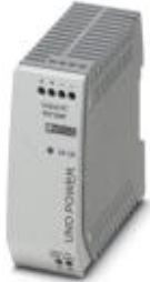
Primary-switched UNO power supply for DIN rail mounting, input: single-phase, output: 48 V DC/60 W

Please be informed that the data shown in this PDF Document is generated from our Online Catalog. Please find the complete data in the user's documentation. Our General Terms of Use for Downloads are valid ( http://phoenixcontact.com/download )