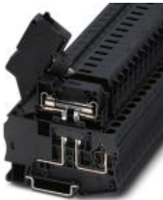
Lever-type fuse terminal block, black, for 6.3 x 32 mm G fuse inserts, with LED for 60 V DC

Please be informed that the data shown in this PDF Document is generated from our Online Catalog. Please find the complete data in the user's documentation. Our General Terms of Use for Downloads are valid ( http://download.phoenixcontact.com )