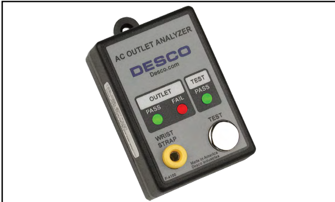
Figure 1. Desco 98132 AC Outlet Analyzer and Wrist Strap Tester