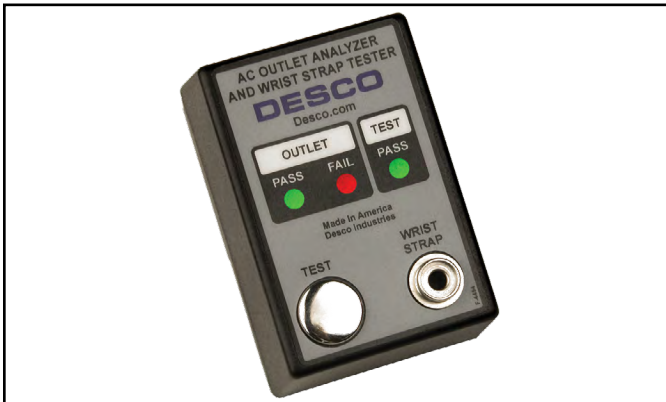
Figure 2. Desco 98131 AC Outlet Analyzer and Wrist Strap Tester