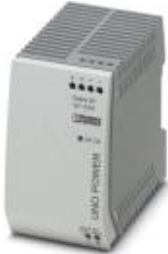
Primary-switched UNO power supply for DIN rail mounting, input: single-phase, output: 12 V DC/100 W

Please be informed that the data shown in this PDF Document is generated from our Online Catalog. Please find the complete data in the user's documentation. Our General Terms of Use for Downloads are valid ( http://phoenixcontact.com/download )