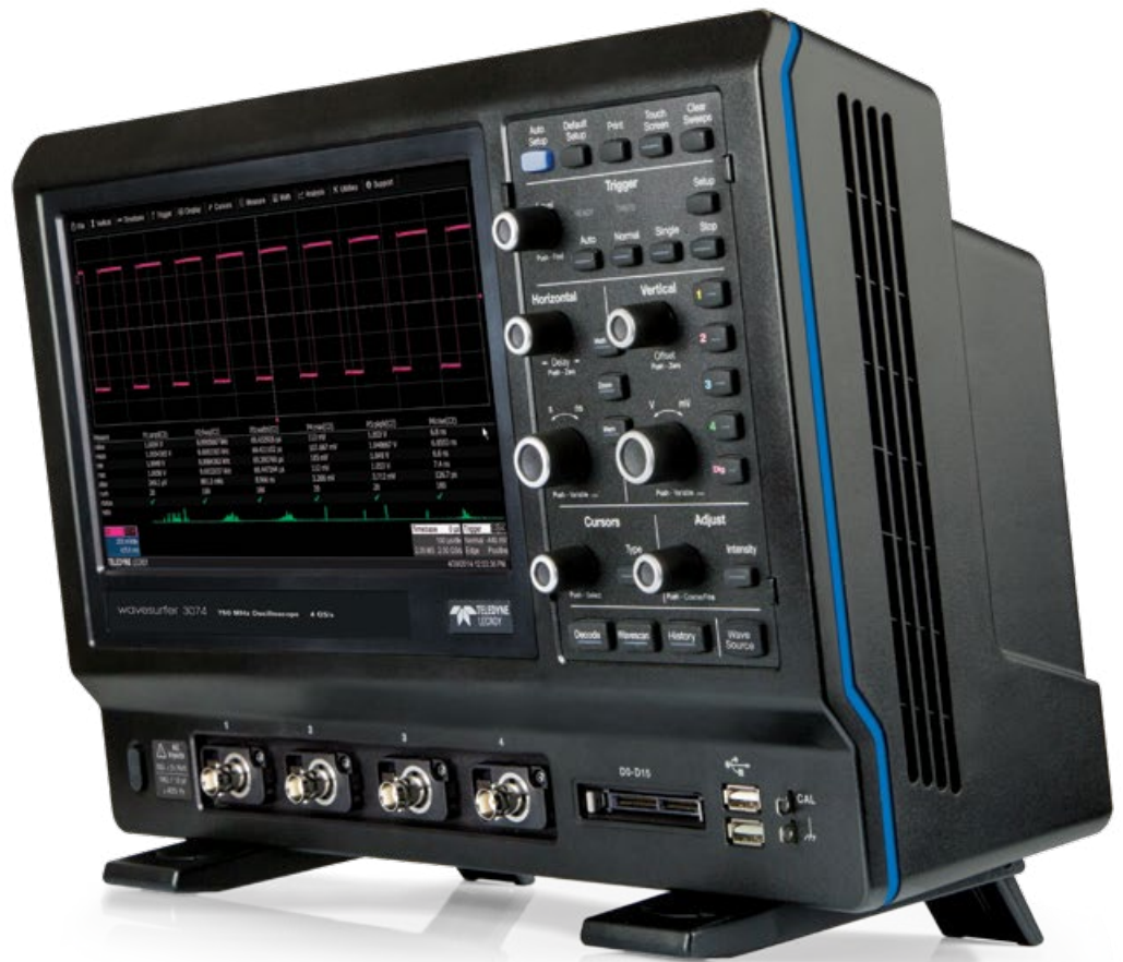
Rotating and tilting feet provide four different viewing positions.

A fast update rate ensures that no waveform variations or details are missed. With an update rate of up to 130,000 waveforms per second the WaveSurfer 3000 is able to easily display random or infrequent events simplifying anomaly detection, identification and debug. Rapidly changing waveforms are easy to see and visually inspect. Changes over time can be seen with the intensity graded persistence display.