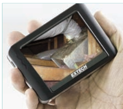
Detachable wireless 3.5" color TFT LCD display can be viewed from a remote location up to 32ft (10m) from the measurement point.

Complete with 4 AA batteries, rechargeable display battery, microSD memory card with SD adaptor, USB cable, extension tools (mirror, hook, magnet) video interconnect cable, AC adaptor (100-240V, 50/60Hz), magnetic base stand, and hard case