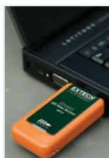
BRD10 - Optional Wireless USB Video Receiver allows user to stream live video to a PC and also can be remotely viewed via VOIP connection