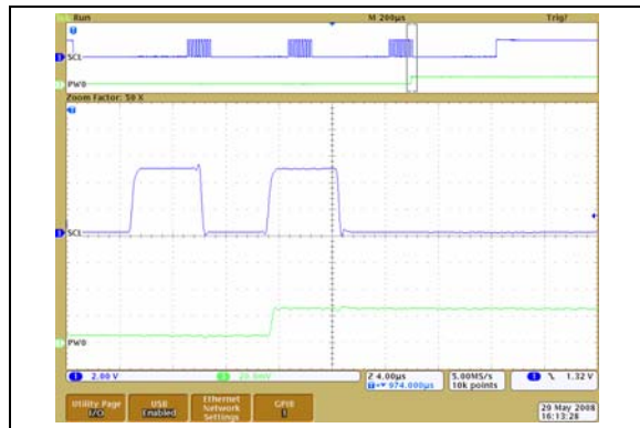
FIGURE 2-44: 50 k \Omega – Low-Voltage Increment Wiper Settling Time ( V_{DD} = 2.7\text{V} ) (1 \mu\text{s}/\text{Div} ).