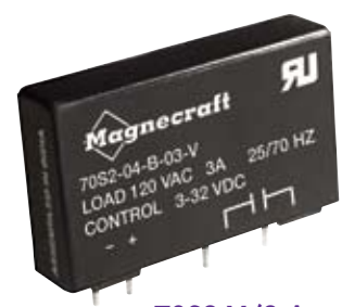
70S2 V (3 Amp)