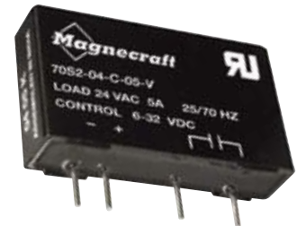
70S2 V (5 Amp)

Since acquiring this line of miniature SSRs from Grayhill, this product has continuously evolved both functionally and visually. The 70S2 Series relays are designed for medium-power loads. The design incorporates a triac output for AC loads and MOSFETs for DC loads. The 70S2 Series relays use optical isolation to protect the control from transients. The 70S2 compact package is available in a combination of screw, fast-on or PCB terminals. Its compact size makes it ideal for designs where space is limited. The 70S2 Series relays have excellent thermal performance.