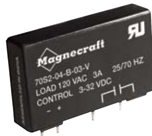
70S2 V (3 Amp)