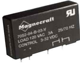
70S2 V (3 Amp)