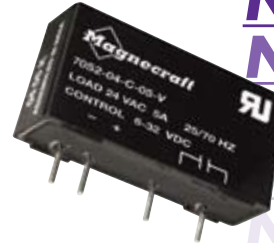
70S2 V (5 Amp)