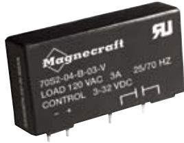
70S2 V (3 Amp)