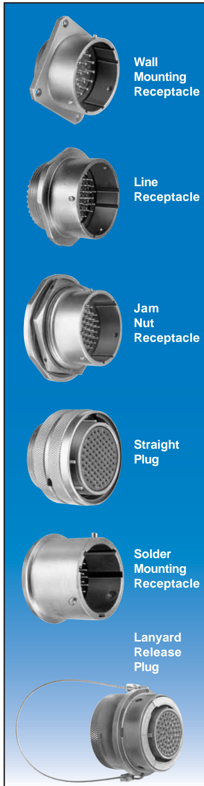
Wall Mounting Receptacle