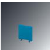
End cover, Length: 28 mm, Width: 2.5 mm, Color: blue