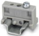
End clamp, width: 6.2 mm, color: gray