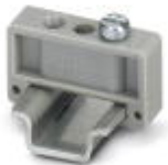
End clamp, width: 6.2 mm, color: gray