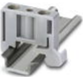
End clamp width: 6 mm, color: gray