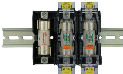
Fuses not included.