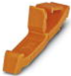
Latching, Color: orange