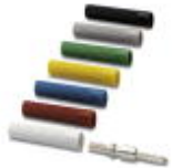
Insulating sleeve, Color: yellow