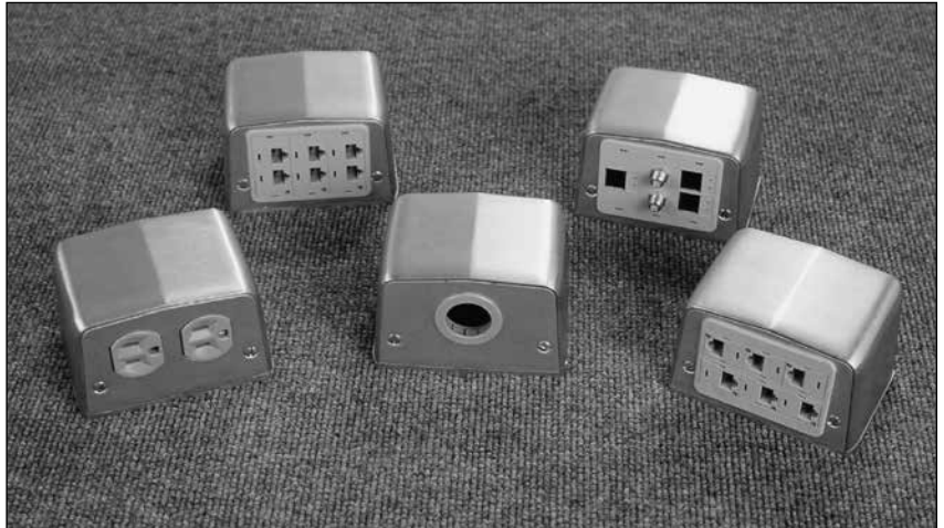
525 Series Fittings provide single service wiring solutions.

525 Series Service Fittings are made from die-cast aluminum with a brushed satin finish. Each pedestal provides a single service, with multiple fittings required for two or more services. This line of fittings is ideal for use in schools, commercial office spaces and in labs.