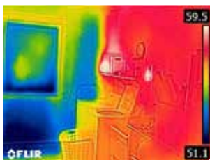
Uninsulated outside wall