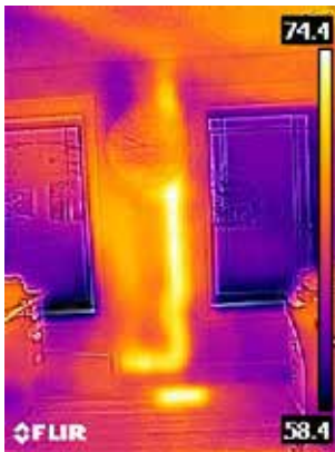
Warm drain pipe in wall