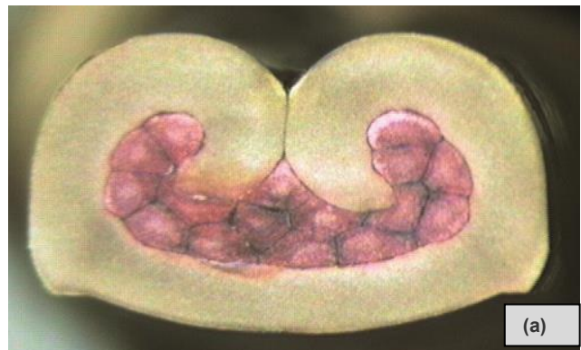
Cross Sections Showing Minimum (a) and Maximum (b) Area Index per Terminal Specification—a Variation of \pm 3.5\%

Therefore, varying the CW by 2% would result in a CH variation of 2%, or 0.0014 in. At a CH tolerance of \pm 0.002 in, 35% of the total CH tolerance would be used by a 2% variation in CW. Thus, the importance of crimp width control is obvious when tooling is changed during a production run.