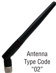
Antenna Type Code "02"

WAN01RSP straight design, 2.2 dBi gain, direct mount connector