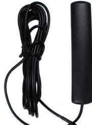
Antenna Type Code "03"

WAN02RSP tilt & swivel design, 2.2 dBi gain, direct mount connector