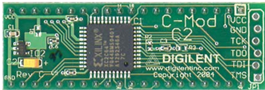
The Cmod board.

Cmod boards combine a Xilinx CPLD, a JTAG programming port, and power supply circuits in a convenient 600-mil, 40-pin DIP package. Cmods are ideally suited for breadboard or other prototype circuit designs where the use of small surface mount packages is impractical. All Cmod boards include: