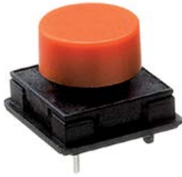
Printmount Switches red