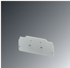
End cover, Length: 72.5 mm, Width: 2.2 mm, Height: 43.5 mm, Color: gray

Please be informed that the data shown in this PDF Document is generated from our Online Catalog. Please find the complete data in the user's documentation. Our General Terms of Use for Downloads are valid ( http://download.phoenixcontact.com )