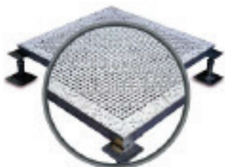
3M™ Static Control Vinyl Floor Tile 8400 Series is available in the special 24.5" x 24.5" size used for raised access floor panels.