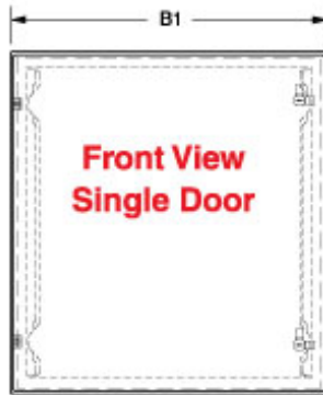
Front View Single Door