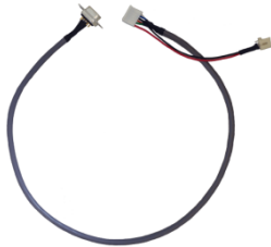
Figure 3: Extended Communication/Power Cable (ESCCPC5V)

The most common cable choice for any standard Matrix Orbital display, the Extended Communication/ Power Cable offers a simple connection to the unit with familiar interfaces. DB9 and floppy power headers provide all necessary input to drive your display.