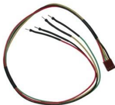
Figure 4: Breadboard Cable (BBC)

The most common cable choice for any standard Matrix Orbital display, the Extended Communication/ Power Cable offers a simple connection to the unit with familiar interfaces. DB9 and floppy power headers provide all necessary input to drive your display.