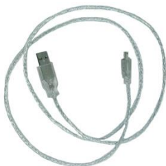
Figure 5: Mini USB Cable (EXTMUSB3FT)

The External Mini USB cable is recommended for the GLK240128-25-USB/GLT240128-USB display. It will connect to the miniB style header on the unit and provide a connection to a regular A style USB connector, commonly found on a PC.