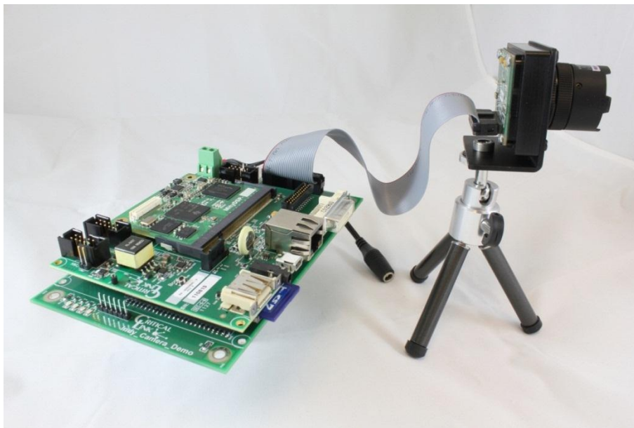
Figure 1 - Vision Development Kit