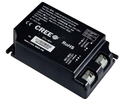
230 V Driver