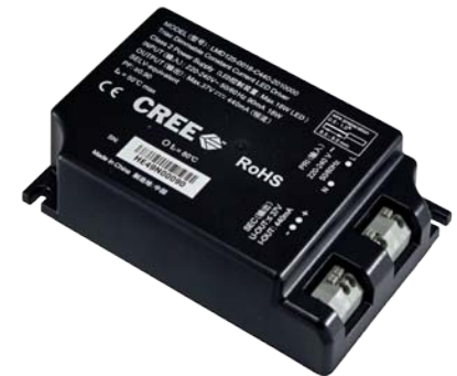
230 V Driver