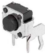
LPV: Through hole, angled