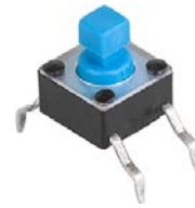
LPS: Through hole, square