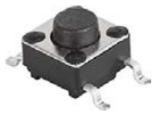
LSH: Gullwing, variable height