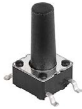
LPH: Through hole, variable height