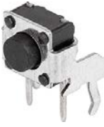
LPV: Through hole, angled