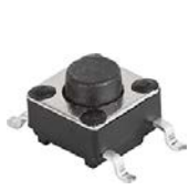
LSH: Gullwing, variable height