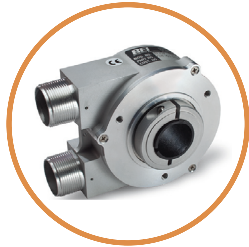
The HS35 Dual Output Encoder