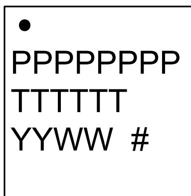
Figure 7.3. Package Marking