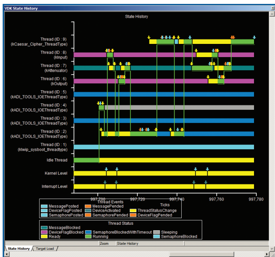
Kernel event history.

For prototype runs and/or small volume deployment, an Analog Devices emulator can be used to flash a program onto your custom system. Accessible through the Automation API, the flash programmer can be scripted, making it possible to develop a turnkey user interface for use by a production floor technician or other individual not familiar with VisualDSP++. Device drivers are provided for all flash devices found on EZ-KIT Lite products, and these drivers can be easily adjusted to support an arbitrary flash device. The Stand-Alone Flash Programmer enables the development engineer to script or automate this process with a license-