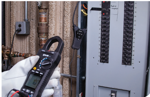
FLIR TA74 used in concert with the FLIR CM83 Clamp Meter