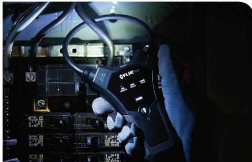
FLIR TA72 with work lights