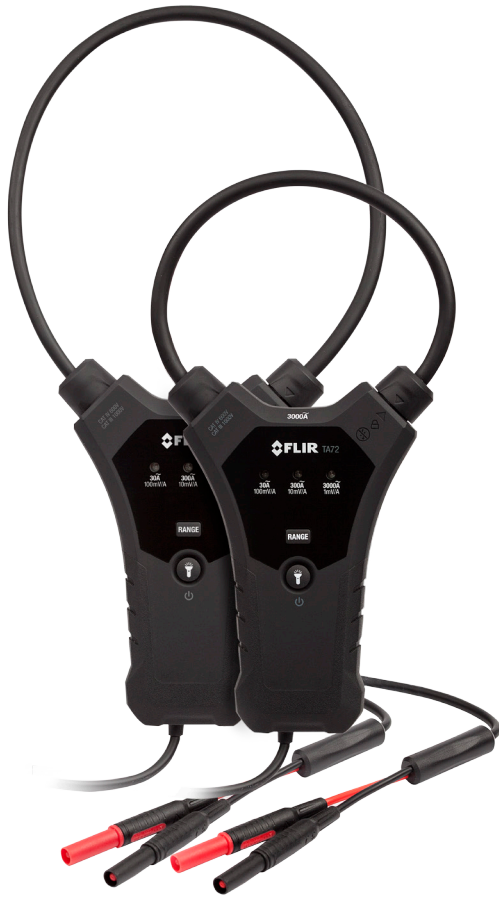
TA74 & TA72