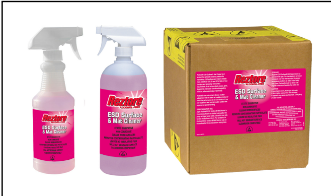
Figure 1. Reztore® Alcohol-Free ESD Surface & Mat Cleaner: 16 Ounces (450 ml) Spray Bottle 1 Quart (950 ml) Spray Bottle 2.5 Gallons (10 liters) Bag-in-Box