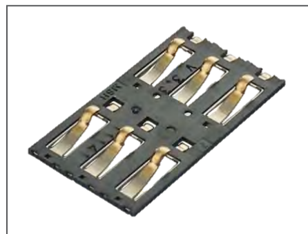
Block-Style SIM Connector, 0.30mm height (Series 78545)