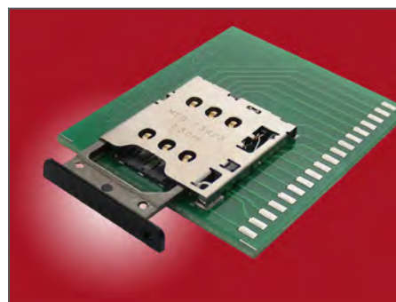
Recommended assembly with SIM connector and Nano-SIM card socket shell fitted with customer-supplied ejector tray