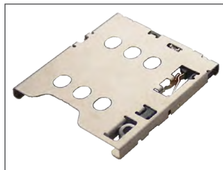
Nano-SIM Card Socket Shell, 1.30mm height (Series 78790)

Use with Ejector Tray (customer-supplied, customizable upon request)