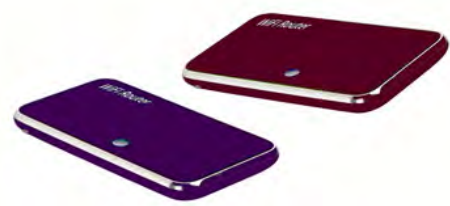
Mobile Wi-Fi* devices