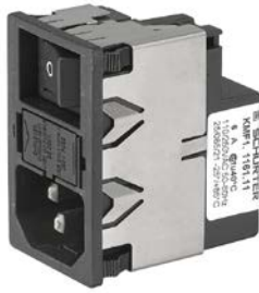
Protection class I with shield