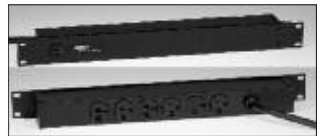
J06B0B20X (Front & Back)