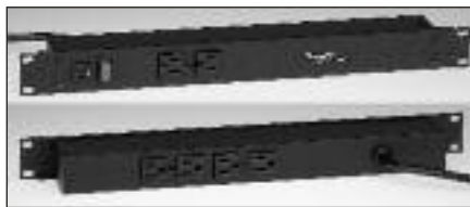
J24B0B (Front & Back)