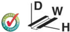
Figure shows PLC-BSC-120UC/21-21/SO46 version

14 mm PLC basic terminal block for high continuous currents with push-in connection, without relay or solid-state relay, for mounting on DIN rail NS 35/7,5, 1 PDT, input voltage 24 V DC