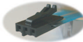
Crimflex Female Receptacles with a Latch Housing (RL)