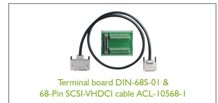
Terminal board DIN-68S-01 & 68-Pin SCSI-VHDCI cable ACL-10568-I