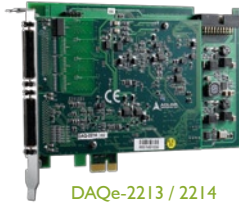
DAQe-2213 / 2214